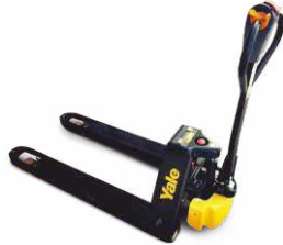
Walkie MPC15 1,500kg