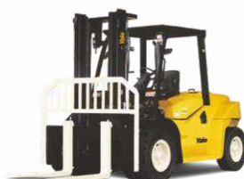
GP50-70UX6 5,000 – 7,000kg