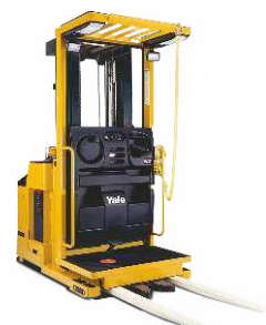
Mid-High Order Picker OS030EF/BF, SS030BF, FS030BF 1,350kg