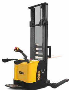
Rider Straddle Stacker MSL15XUX 1,500kg