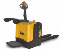
Rider Pallet MP20XUX 2,000kg