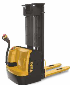
Walkie Stacker MS15UX 1,500kg