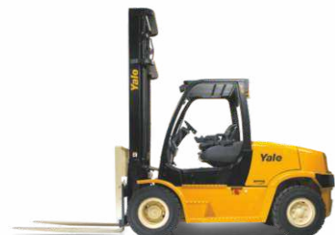
4 Wheel ERP70-90VNL 7,000 - 9,000kg