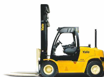
GP135-155VX 6,000 – 7,000kg