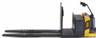
Low Level Order Picker MPC 060-080-VG 2,700 - 3,600kg