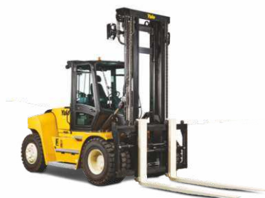
GDP80-160DF/EF 8,000 – 16,000kg