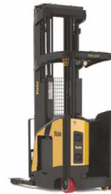
Stand-Up Moving Single Double Reach NR/NDR030-045EC, NR/NDR030-040DC 1,360 - 2,041kg