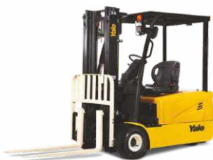
3 Wheel ERP16-20UXT 1,600 - 2,000kg