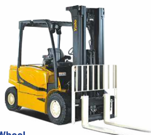
4 Wheel ERP40-55VM 4,000 - 5,500kg