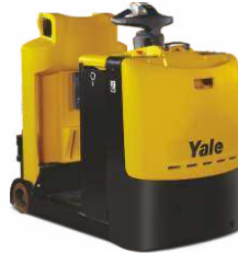
Stand-Up M050T, M070T 5,000 - 7,000kg