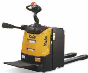
Rider Pallet MP20X 2,000kg