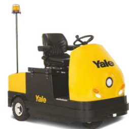
Sit-Down MT70-80 7,000 - 8,000kg

No matter how big or small your warehouse