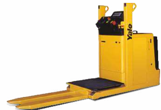
Low/Mid Order Picker M010E AC 1,000kg