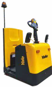
Stand-Up MT30XUX 3,000kg