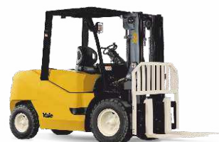
GP40-50UX 4,000 – 5,000kg