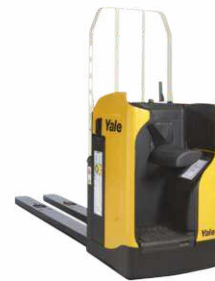
Encloser Rider Pallet MP20-25T 2,000 - 2,500kg