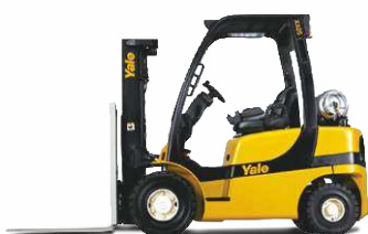
GP40-55VX 4,000 – 5,500kg