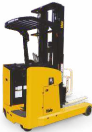
Stand-Up Moving Mast FBR13-18S(W)Z, FBR20-30SZ 1,250 - 3,000kg