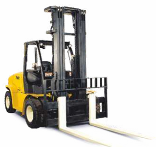
GP170-190VX 8,000 – 9,000kg