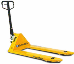
Pallet Jack YPT25 2500kg