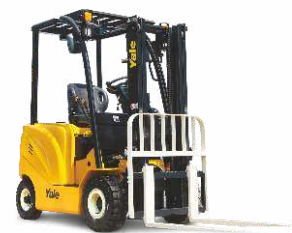
4 Wheel ERP15-35UX 1,500 - 3,500kg