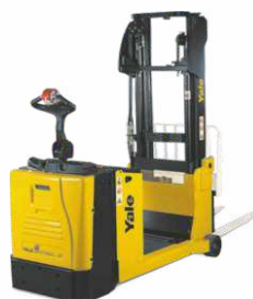
Walkie CB Stacker MC10-15 1,000 - 1,500kg