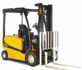
4 Wheel ERP22-35VL 2,200 - 3,500kg