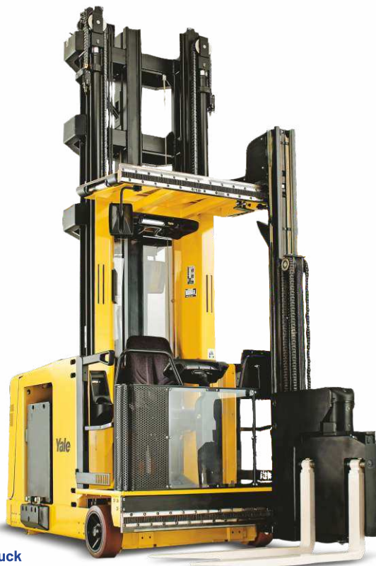
Man-Up Turret Truck MTC10-15L 1,000 - 1,500kg