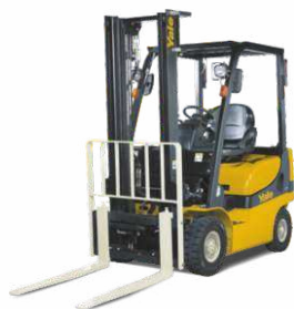
GP16-20SVX 1,600 – 2,000kg