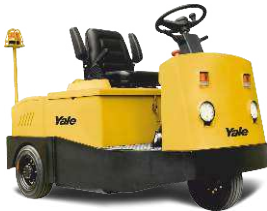
Sit-Down MT60UX 6,000kg