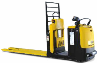
Low Level Order Picker M020-25 2,000 - 2,500kg