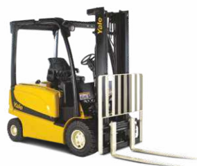
4 Wheel ERP16-20VF/ERP030-040VF 1,600 - 2,000kg