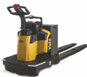
Rider Pallet MPE060-080VH 2,700 - 3,600kg