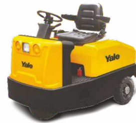
Sit-Down MT30UX 3,000kg