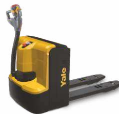
Walkie MP20KUX 2,000kg