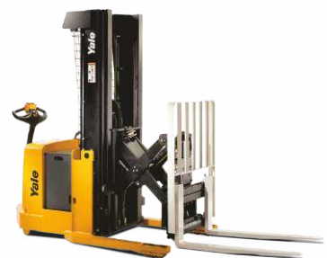
Walkie Reach Stacker MRW020-030E 900 - 1,350kg