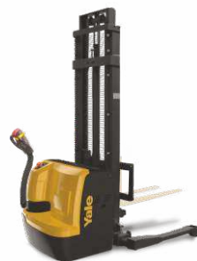
Walkie Straddle Stacker MSL15WUX 1,500kg