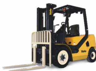
GP20-35UX 2,000 – 3,500kg