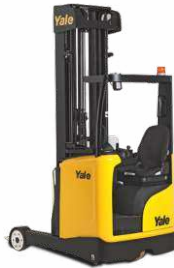
Sit-Down Moving Mast MR10-14E, MR14-25 1,000 - 2,500kg