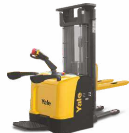
Rider Stacker MS15XUX 1,500kg