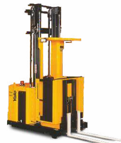
Mid-High Order Picker M010S 1,000kg